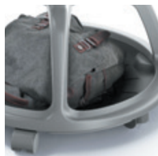
Integrated storage space